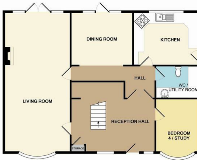
GROUND FLOOR APPROX. FLOOR AREA 1037 SQ.FT. (96.4 SQ.M.)