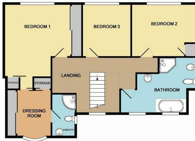
1ST FLOOR APPROX. FLOOR AREA 812 SQ.FT. (75.4 SQ.M.)

TOTAL APPROX. FLOOR AREA 1849 SQ.FT. (171.8 SQ.M.)